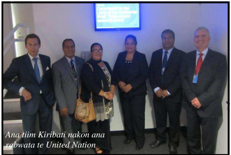
Ana tiim Kiribati nakon ana rabwata te United Nation

Man reken te kariaia man ana rabwata te aon- naba (UN) iaon karababan ara marawa i antari bon ngaia ae ena kona ni karekea te kabwaia nakoia ana botanaomata Kiribati. Ngkana e kariaiakaki ana