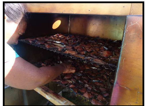
Karaoan te smoke fish