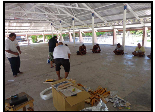
Reiakinaia mwane aron kabae an bwaai n akawa

A kitana Tarawa kain te tiim man te Botaki n Akawa ao Karikirakean Kaubwain Marawa ni 8 nakon 16 n August 2013 ni kaea te abamwakoro ae Arorae. E boboto te mwananga aio ibukin te t u t u o nakon te auti ni kamaitoro, te anga reirei iaon karaosan bwain akawa ao kamwauan te ika man te bubu n ai ao ai te kakae iaon aekan bwain akawa aika rangi ni kainanoaki irouia kain te aba. Te waaki aio e bon teimatoa ni kakaraoaki irouia naake tabeia te itera aio man te Botaki n Akawa ao Karikirakean Kaubwain Marawa ibukin kateimatoan buoka mai tinaniku riki mai iroun te tautaeka n Tiaban are ngaia ae aki toki ni mwamwanena te itera aio.