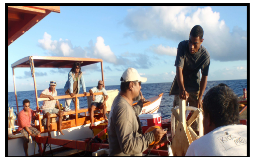
Reiakinaia aron kanimwan bwaai n akawa