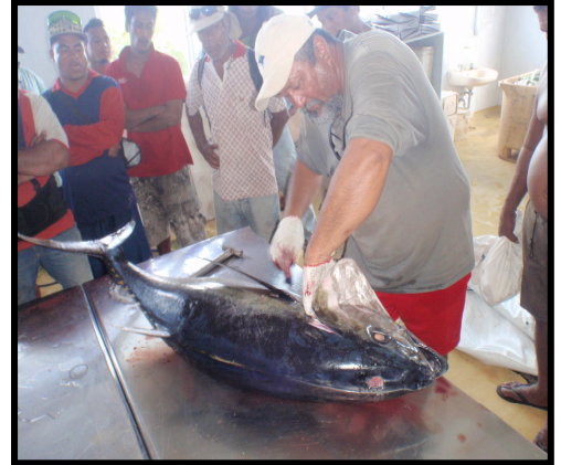
Kanakoan kanoan nanon te ika