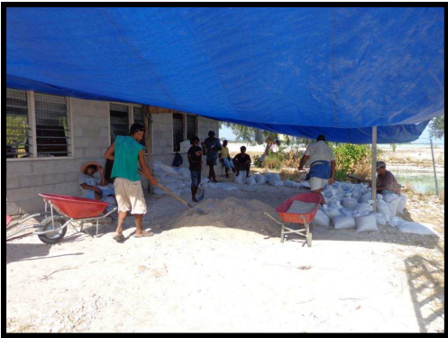
Tabeman mai ibuakoia taan mwakuria te nei