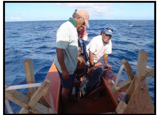
Aron kanakoankin raran te ika n te tai are e moan teke iai