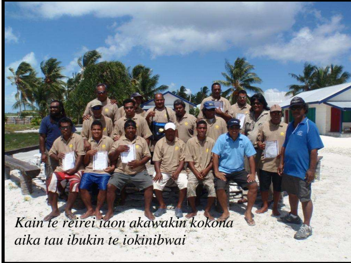
Kain te reirei iaon akawakin kokona aika tau ibukin te iokinibwai

Iokinibwaian te ika bon teuana mai ibuakon te karekemwane ae rangi ni korakora nakon te tia akawa ea moamoa riki nakon te aba teuana ma teuana m a n iokinibwaiana nako tinaniku.