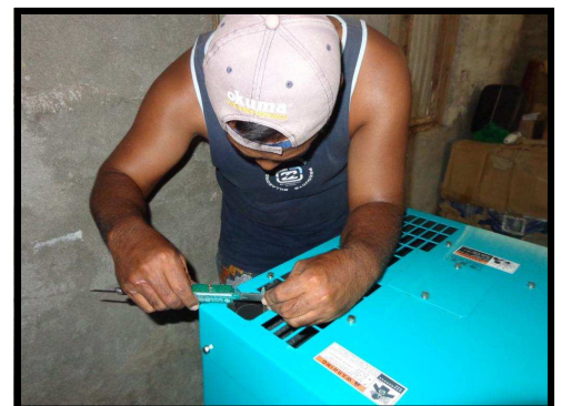
Kanimwan bwain ana auti ni kamwaitoro Butaritari