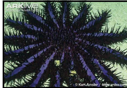
Tamnein te man ae te Aa

E kukurei ni katanoata am Kambwana ae Te Atinimarawa bwa ana kaibuke ae LC Tekimarawa ea tia ni kitana te tabo are kabaaki iai. E tuai ataki raoi te tai are ena roro iai n te nne n roro are i Betio.