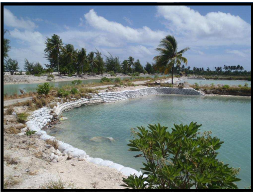
Iteran te nei nako Bonriki ngaia ae wa-aki te mwakuri iaona