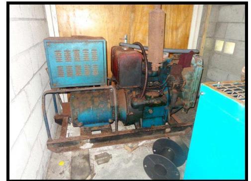
Bwain te auti ni kamwaitoro iaon Makin ake tuoaki