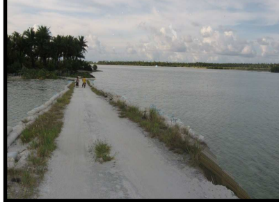
Te Causeway are I marenan Kariraia ma Bikeriki

Ma n te tai aei ao e tiku bwa te titiraki bwa e na kanga raoi aron ae e na waakinaki te karikirake aei n abara aika moan te uareke ao ni kai rootaki ni bibitakin kanoan bong.