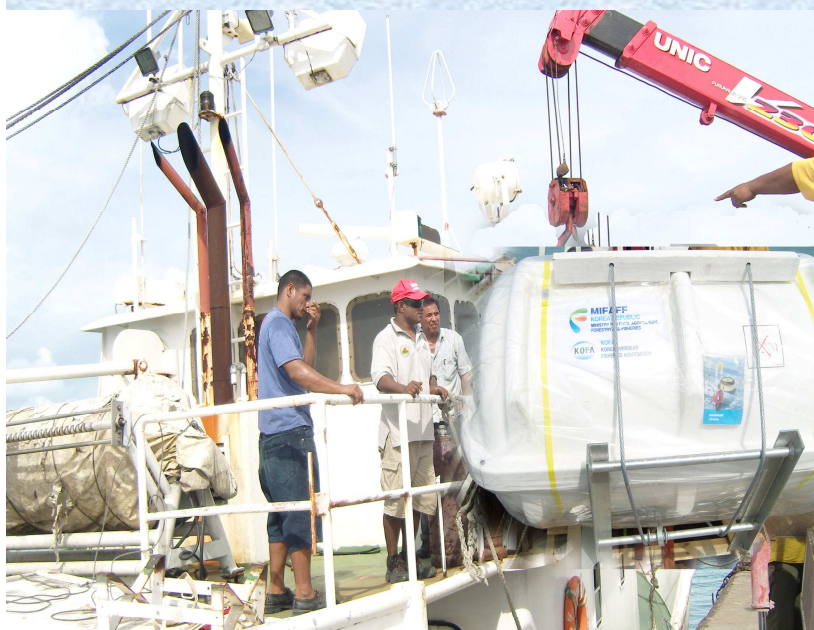
Karuoakin te Booti ni Kamaiu nako aon MV Te Tia Akawa

Te booti ni kamaiu ke te raft boat Akawa. bon teuana ibuakon kanoan te konteina are e bwaintangiraia