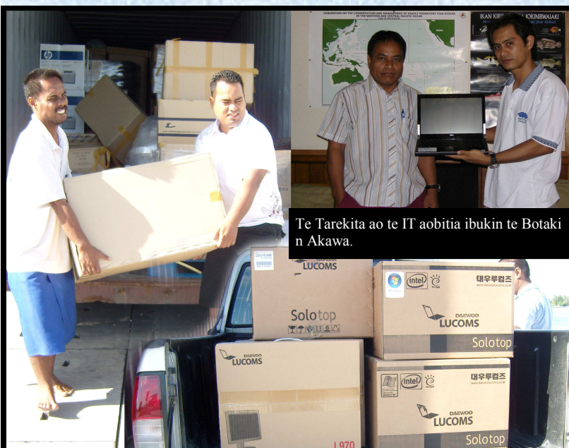
Te Tarekita ao te IT aobitia ibukin te Botaki n Akawa.

Karaaian kanoan te Konteina irouia kain te Planning mai tabon te uaabu.