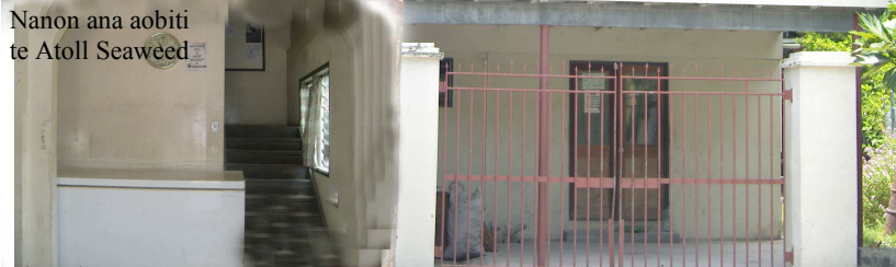
Nanon ana aobiti te Atoll Seaweed

E a waaki ngkai katamaroan te aobiti are ana aobiti ngkoa te ti-wiita ibukin tangoakina are e na kabooaki (rent) iroon te Kambwana are e a kaman tataekinaki taekana ae te Kambwana are e na kaboa nako te atama ma te tano.