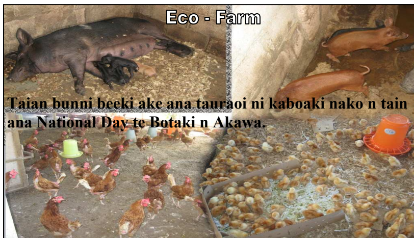
Taian bunni beeki ake ana tauraoi ni kaboaki nako n tain ana National Day te Botaki n Akawa.

Mwaitin te aomata are a kona n toka iaon te Booti ni Kamaiu aio bon uangaun ma niiman (25). Te kantan- inga bwa e na bon rang boongana ibukiaa taan mwakuri ao naake a kakabongana MV Te tia Akawa.