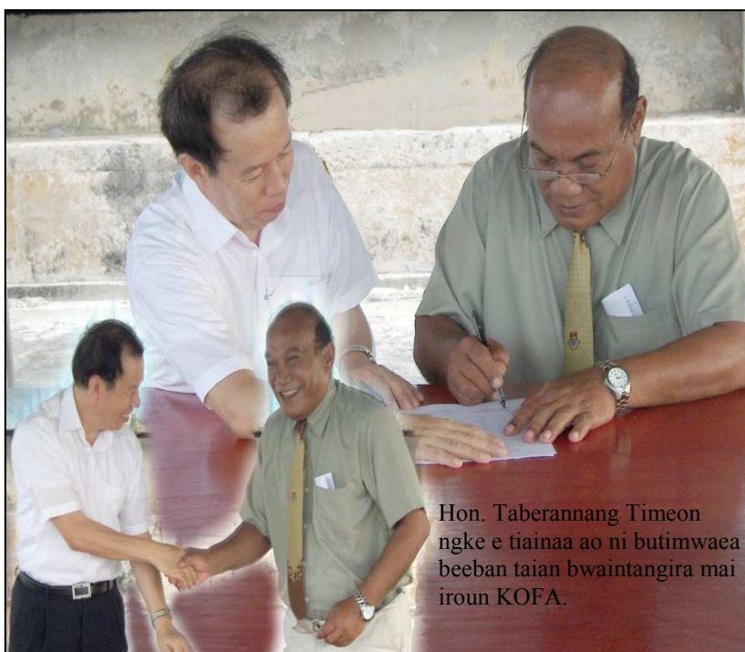
Hon. Taberannang Timeon ngke e tiainaa ao ni butimwaea beeban taian bwaintangira mai iroun KOFA.

E karaoaki te bootaki ae uare-reke n ana tabo te Central Pacific Producer (CPPL) ibukin butimwaeen ana baintangira KOFA nakon Kiribati n te bong ae te katenibong 9th September 2009.