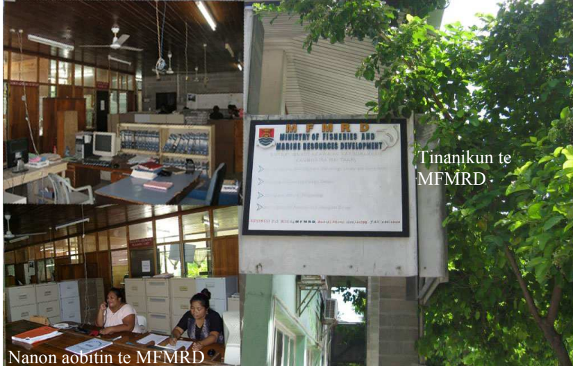
Nanon aobitin te MFMRD

E nang katamaroaki aobitin te MFMRD are i Bairiki.