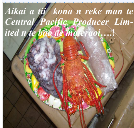
Aikai a tii kona n reke man te Central Pacific Producer Limited n te baa de miteraoi....!