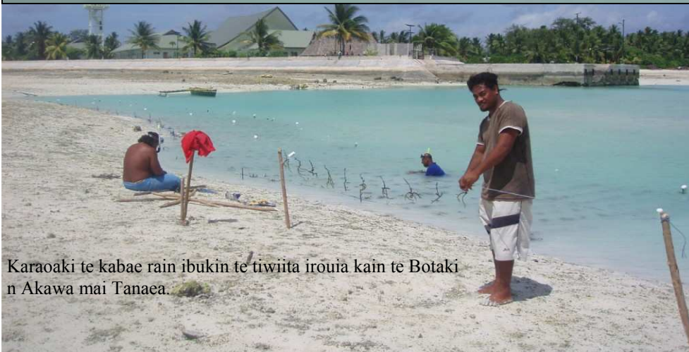
Karaoaki te kabae rain ibukin te tiwiita irouia kain te Botaki n Akawa mai Tanaea.