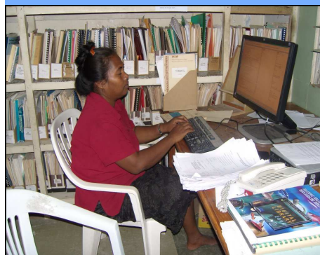
Karinakin taian ware iaon te computer iroun temanna te aobitia man te Fisheries Division.

Imwin te mananga are karaoaki I Tabiteuea Meang ao Tabiteuea Maiaki ao kaain te tiim aio a bon wakina na ni iburoki ni karinan waare imwin te mwakuri ni kareke rorongorongo ke te maroro iaon kaubwain marin ara marawa ni iko-taki ma te katei ao te maiu are e kataoaki n abamakoro aikai.