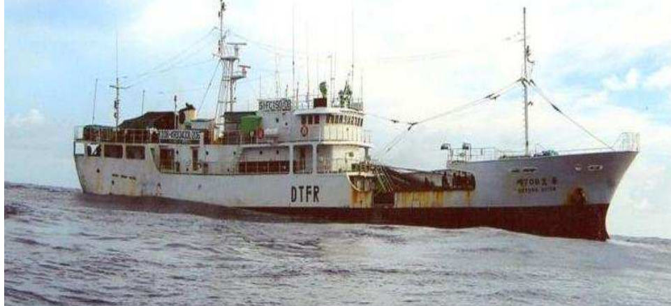
(Oryong 708, Longline, KOFA)

Teuana ibuakon wanibwi ma onoua (86) ana tuua ni kaibuke te kambwana ae te Korean Overseas Fisheries Association (KOFA). Te kambwana aio are e raitienti n akawa ni Marawan Kiribati ao man tia naba ni kabwaka ana roo n akawa ibukiia ana kaibuke ake a teimatoa ngkai n akawa ni marawan Kiribati. Noora bwaninin rongorongona ni iteranibaa 2.